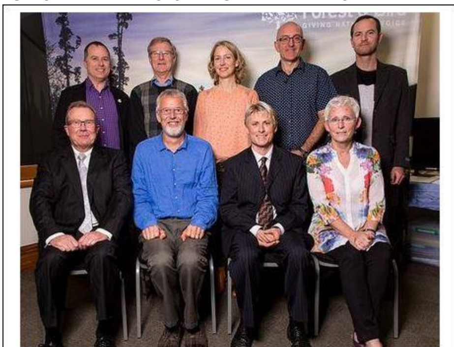
FOREST AND BIRD 2016 BOARD