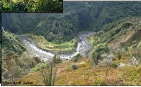
Location: Otaki Gorge Road

This trip is part of Dept. of Conservation's Conservation Week