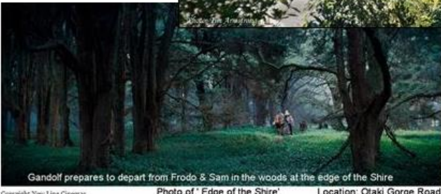
Photo of 'Edge of the Shire'