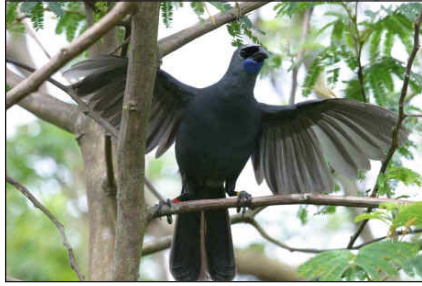
File photo of kokako

Timberlands did a 1080 drop in 2004 when the birds numbered 43. DOC followed with 1080 drops in 2007 and 2008 increasing the population to 69 in 2009. It is thought there could be close to 100 birds in the block at present.